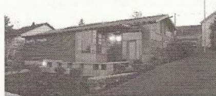
2005 Citation Award • HKP Architects Mason/Roth House