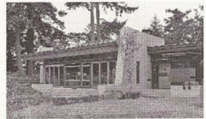
2005 Honor Award • Prentiss Architects Cady Mountain Home