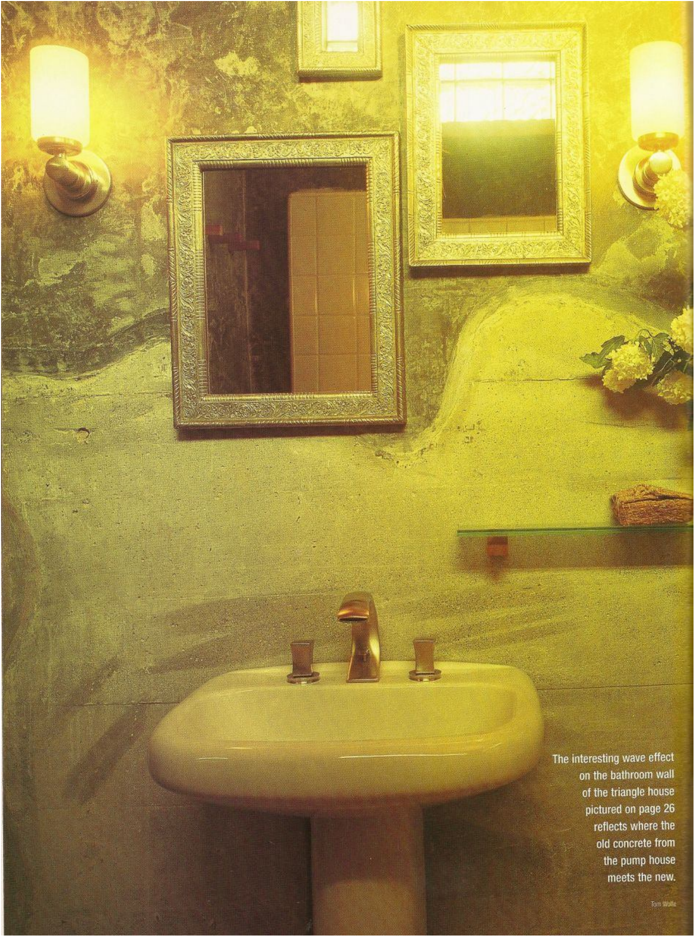
The interesting wave effect on the bathroom wall of the triangle house pictured on page 26 reflects where the old concrete from the pump house meets the new.